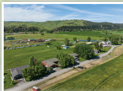
Built five resident homes by 1990