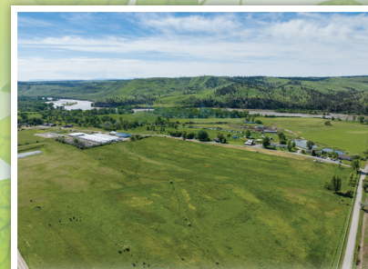
Special K Ranch 2023