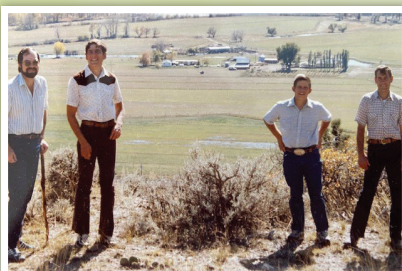
First four residents January 1987

And we know that in all things God works for the good of those who love him, who have been called according to his purpose. Romans 8:28