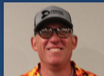
MOST IMPROVED RANCHER