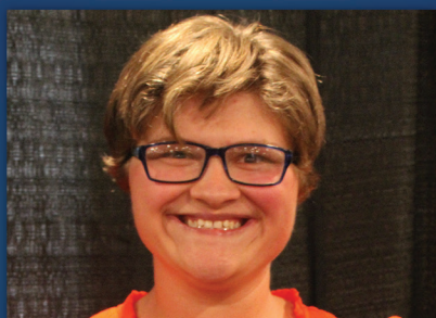
RANCHER OF THE YEAR