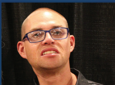
RANCHER OF THE YEAR