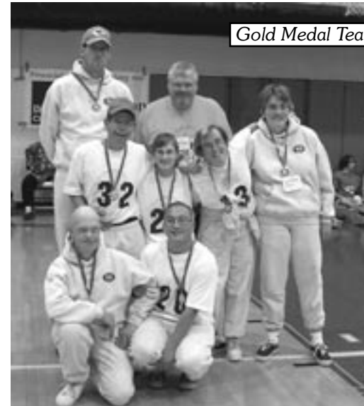
Gold Medal Team