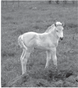
The newest addition to the Special K Family "Sven"

www.specialkranch.org E-mail: specialkranch@hughes.net